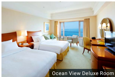
Ocean View Deluxe Room