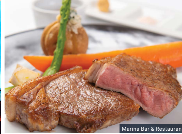
Marina Bar & Restaurant